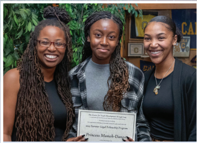
Princess (in the middle) at the graduation